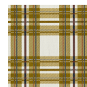
904-22 - Johnson Modern