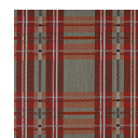
904-44SR - Dress McDonald - SR