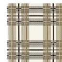
904-11 - Durkin Classic