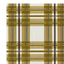
904-22SR - Johnson Modern - SR