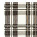
904-37 - Willis Watch