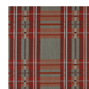
904-44 - Dress McDonald