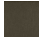
716-84 - Aged Nickel