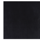
716-90 - Blackened Steel