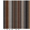
1082-23 - Shadow Agate