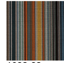
1082-62 - Turquoise Agate